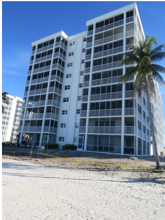
Photo 4, View of West Elevation.