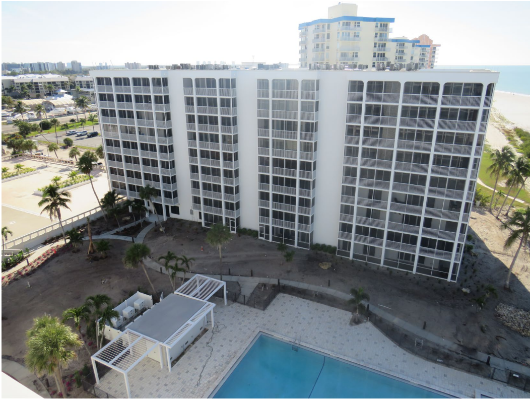
Photo 1, North Elevation

7150 Estero Blvd – Wind Mitigation Inspection