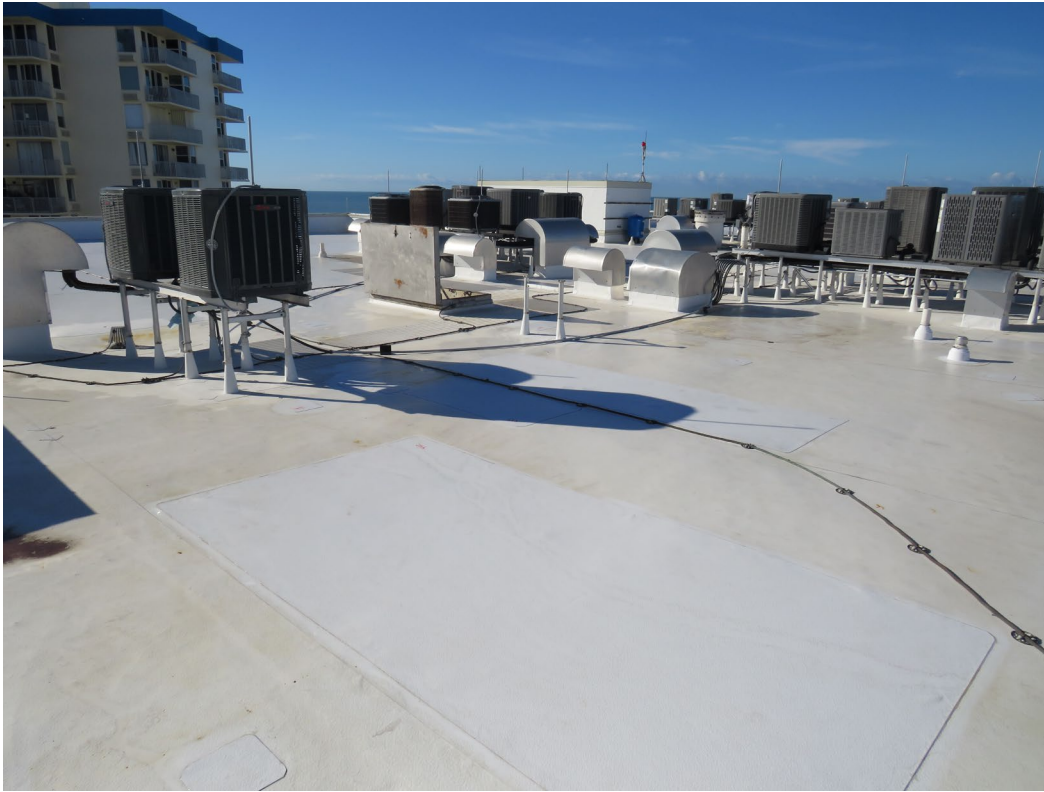
Photo 5, Overall view of TPO roof system.

7150 Estero Blvd – Wind Mitigation Inspection