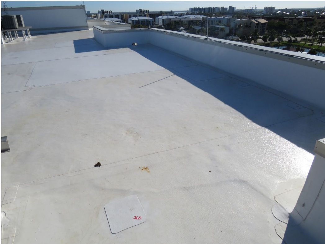
Photo 6, Overall view of TPO roof system.