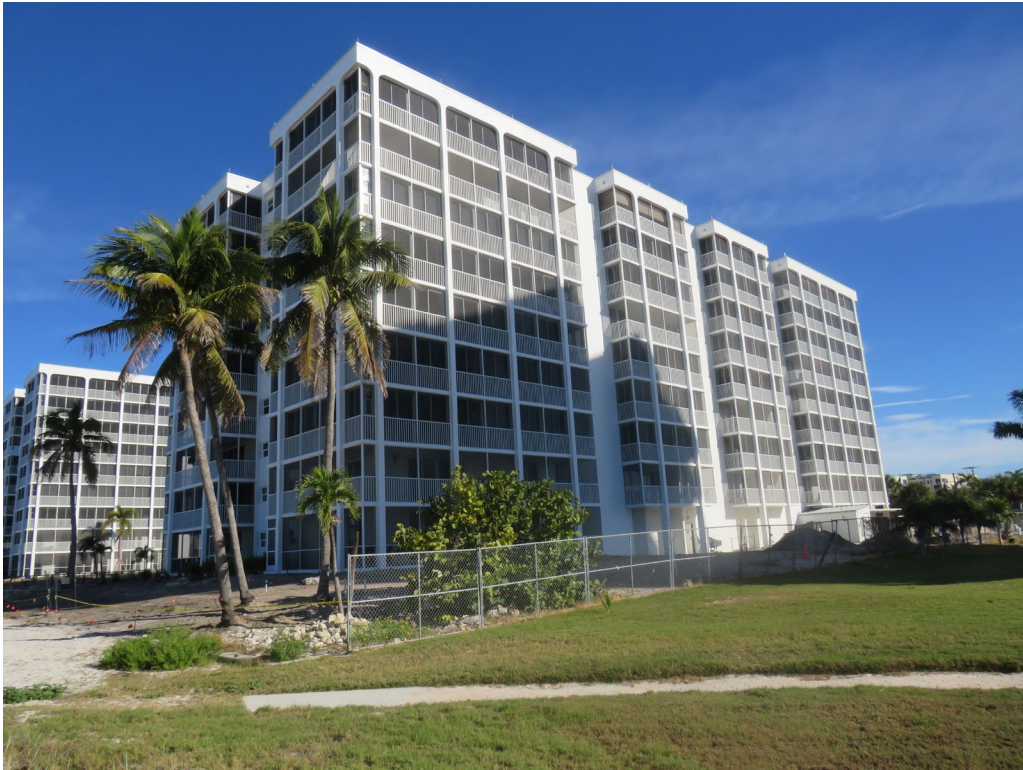
Photo 3, South Elevation

7150 Estero Blvd – Wind Mitigation Inspection