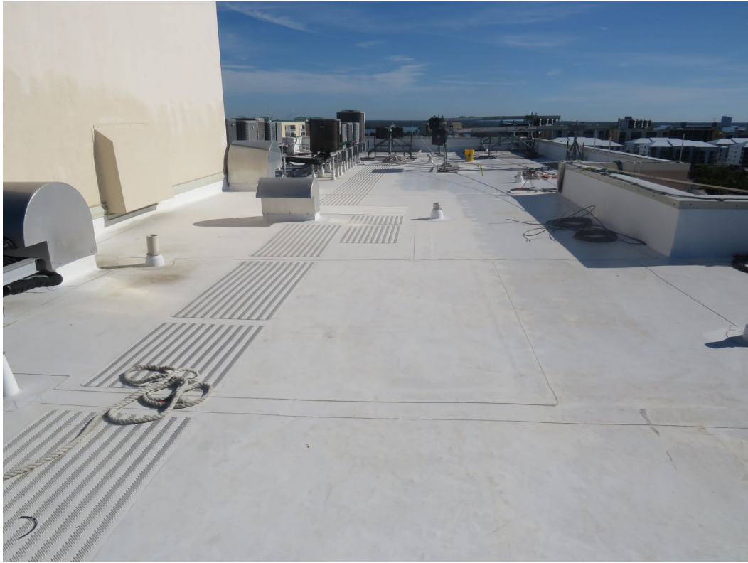
Photo 5, Overall view of TPO roof system.

7148 Estero Blvd – Wind Mitigation Inspection