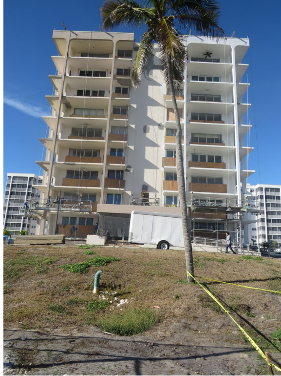
Photo 3, East Elevation

7148 Estero Blvd – Wind Mitigation Inspection