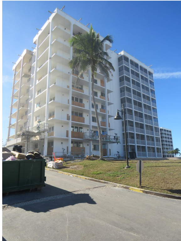
Photo 4, View of North Elevation.