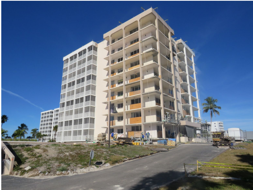
Photo 2, South Elevation