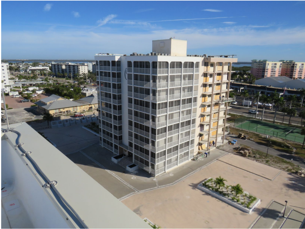
Photo 1, West Elevation

7148 Estero Blvd – Wind Mitigation Inspection