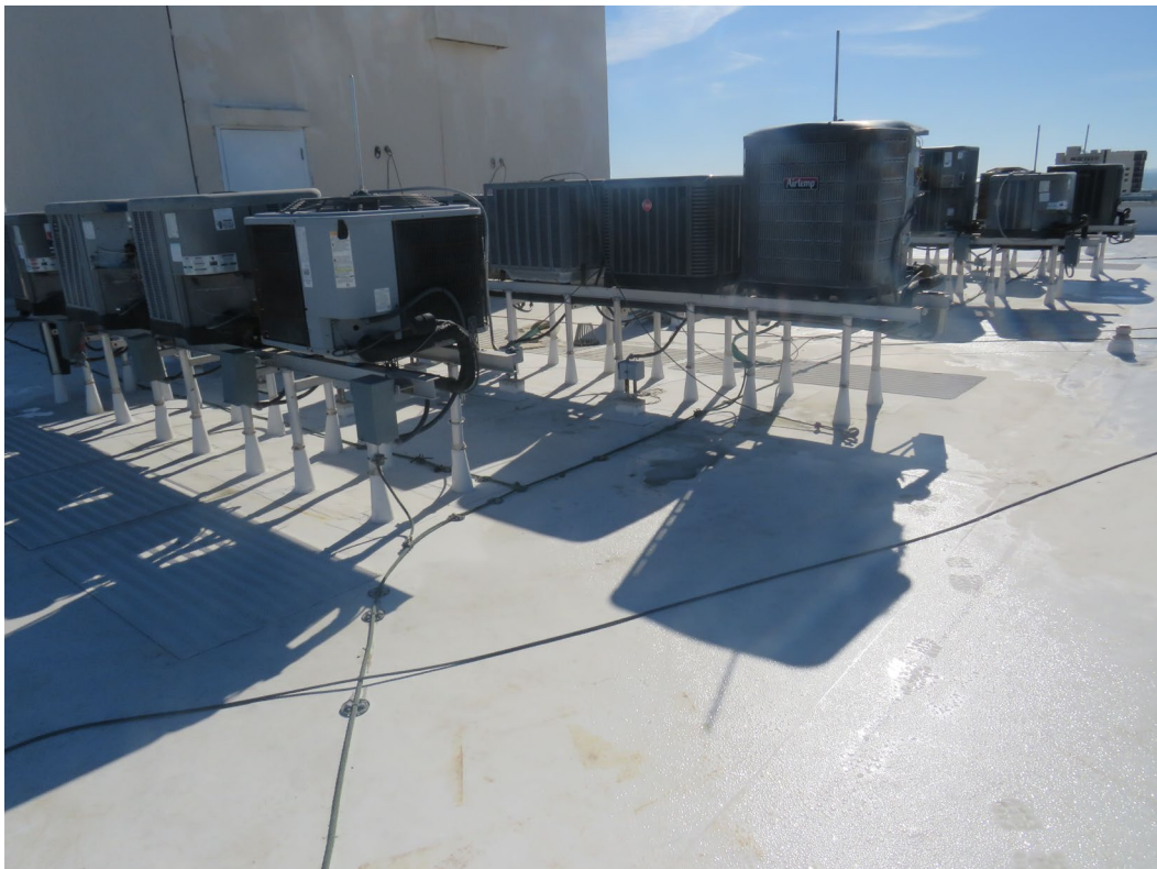
Photo 6, Overall view of TPO roof system.